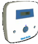
Optional RF boost switch