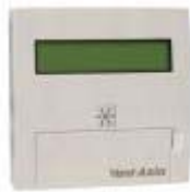
Optional LCD remote controller